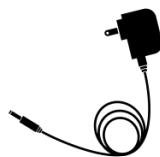
12V DC Adapter